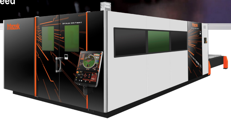
OPTIPLEX 3015 FIBER III

Witness Mazak Optonics high power OPTIPLEX 3015 FIBER III with the new cutting-edge PreviewG Control and our latest edition to our family of top-tier builders, Yaskawa America, Inc, Motoman Robotics Division at Capital's ADVANCES IN PRECISION FABRICATING .